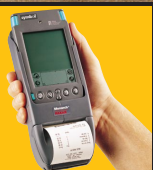
Monarch® 6015™ Handheld Printer

NOW YOU CAN GET AS MUCH OUT OF YOUR PDA AS YOU PUT INTO IT.